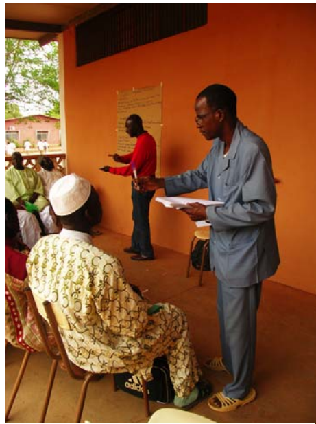
Focus group meeting for the two farmers unions of Sene Kunafoni Bulon and Jèkafo Guèlèkan. Mali.

Mali is currently undergoing a major reorientation in the roles of the state and the other actors in agriculture. The recently adopted Loi d'Orientation Agricole is reflecting this new dynamic.