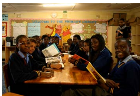
Students at Rhodes Park Junior School taking part in the Global Teenager Project. Zambia.

In Zambia, The Netherlands is one of the eight development partners providing support through a common pool account, and is among the largest donors in the sector. The Embassy has developed a partnership with the World Bank, whereby the Embassy will represent the World Bank in the education sector.