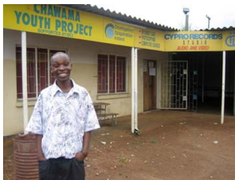
IT Trainer outside his classroom. Chawama Youth Skills Project. ZXambia

Projects also help teachers to use ICT in order to digitise materials for use in the classroom. This requires teachers to be trained not only in basic ICT skills but also in pedagogical skills to use online tools and teaching materials in the classroom.