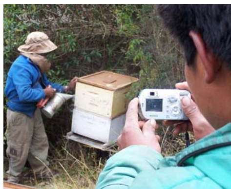
AGRECOL documenting by digital camera

Include a budget for maintenance of ICT equipment .