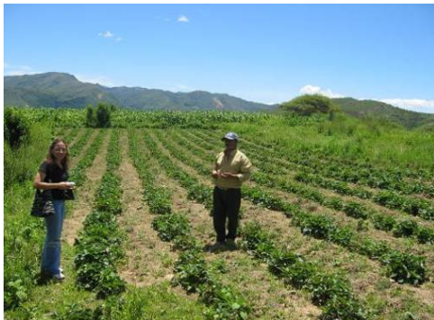
ICO visiting a participating farmer

The IICD Roundtable workshop for the agriculture sector that took place in 2002 identified three main obstacles that stand in the way of agricultural products being successfully commercialised: lack of infrastructure (roads, storage facilities, electricity); inefficient post-harvest handling and distribution; and a lack of information. Small-scale farmers operate at the tail end of a long chain of intermediaries where the relationship between the small producers and the buyers is uneven. In Bolivia farmers 'sell low and buy high'.