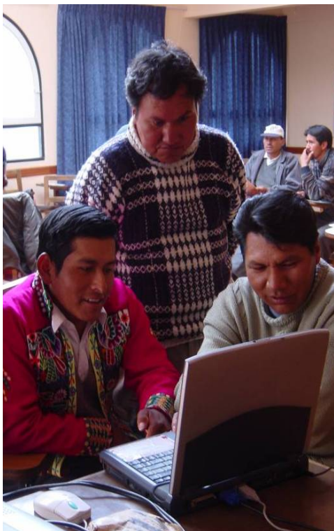
Agriculture sector focus group meeting

To date, the agriculture projects have provided ICT and technical training to over 1,250 people and 3,780 small-scale producers participate actively in the projects. Meanwhile, another 140,000 producers are benefiting indirectly from the