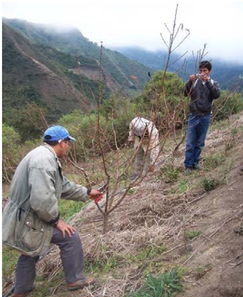
ACLO documenting good practice by photography

Part of the project team has received ICT training via participating in the APCOB project training. A large number of support services and a wide range of paper and digital information bulletins have been developed. In addition, CEPROBOL has set up a knowledge base containing information on Bolivian exporters, country profiles, agricultural produce profiles and other market records, and has developed information packages for Bolivian embassies. CEPROBOL has been present in a large number of national and international commercial events where they facilitated the presence of potential Bolivian exporters.