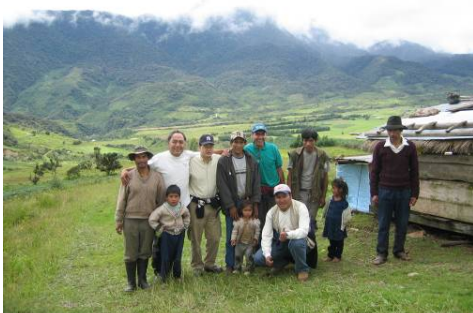
Farmers participating in AGRECOL project

Information and communication technology (ICT) can play an important role in empowering, increasing social participation, and providing economic opportunities for marginalised groups such as small-scale farmers, through better access to markets for example. The technologies can also help improve the quality and transparency of public services countrywide.