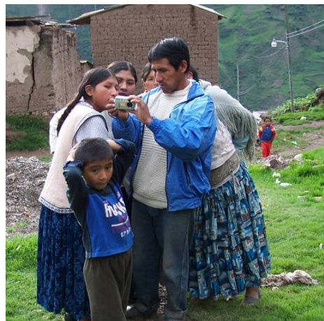
AGRECOL project using digital camera

The majority of Bolivia's poor live in rural and remote areas and have livelihoods that are closely linked to smallholder agriculture. The low productivity of the farm sector and the low prices that farm products command in the marketplace are central concerns to them. The use of small-