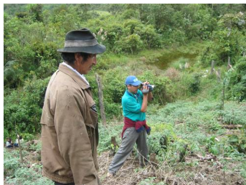
Video documentation for AGRECOL project

The programme reaches a large group of farmers as they will have access to Internet at the provincial government offices and at information centres operated by IICD project partners and other projects in the provinces. Through this network of information centres, at least 2,000 farmers in two provinces are expected to become direct users in the first phase. Additionally, other beneficiaries are the farmers that are being informed through rural radio programmes. Currently 50,000 farmers are reached by the ICO project, which will transfer the radio services to the local government.